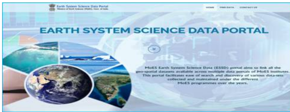
Picture: Home page of the MoES-ESSDP, a one-of-a-kind digital platform bringing together data and information of earth system science on a single dynamic web platform.