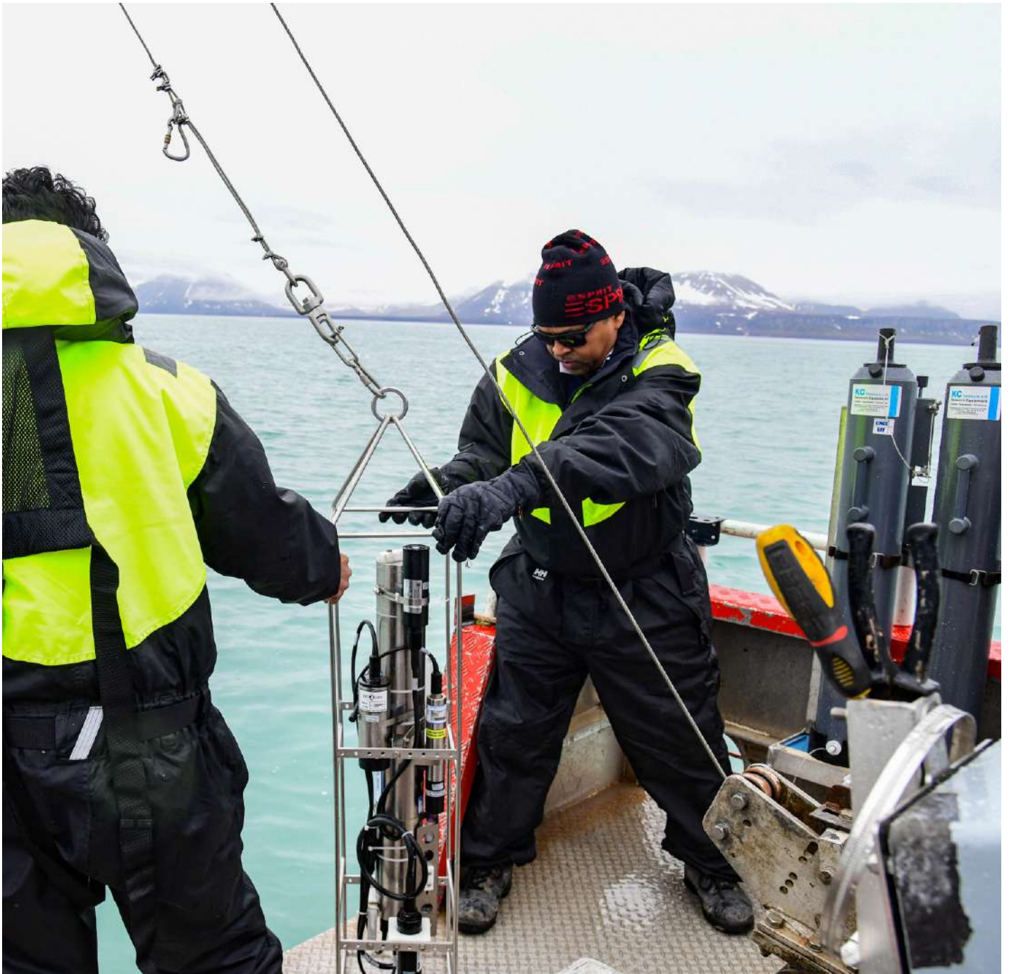
Indian scientists taking hydrographic measurements in Kongsfjorden, Svalbard

5.0.8 Work towards the linking of International North-South Transport Corridor with the Unified Deep-Water System and its further extension to the Arctic. North-South connectivity may result in lowering shipping costs and overall development of the hinterland and of indigenous communities, more than East-West connectivity.