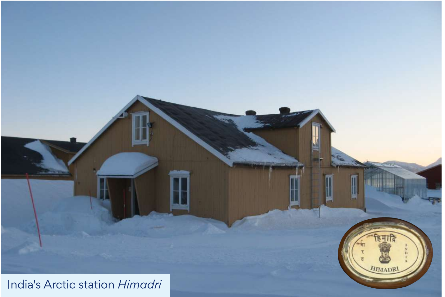
India's Arctic station Himadri

1.2.6 India's Arctic station Himadri is presently manned for about 180 days a year. Since its establishment, over three hundred Indian researchers have worked in the station. India has sent thirteen expeditions to the Arctic since 2007 and runs twenty-three active projects. With participation in the Svalbard coastal cruise and in several other international expeditions, India's engagement in the Arctic has significantly risen in recent times.