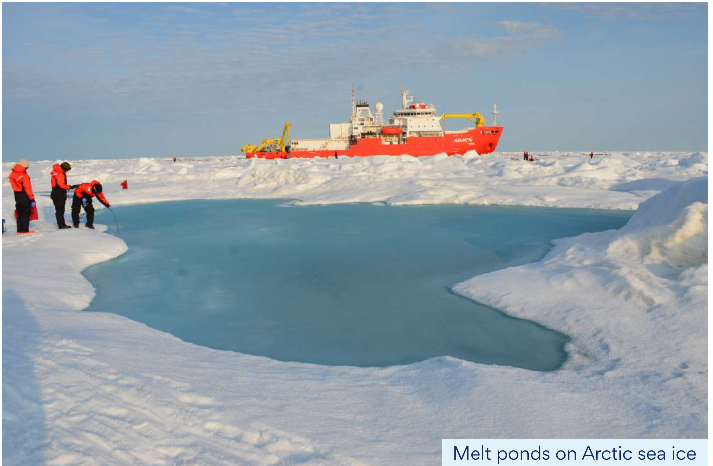
Melt ponds on Arctic sea ice

1.1.6 Melting Arctic ice also opens up new opportunities like energy exploration, mining, food security, and shipping. India can contribute in ensuring that as the Arctic becomes more accessible, the harnessing of its resources is done sustainably and in consonance with international best practices.