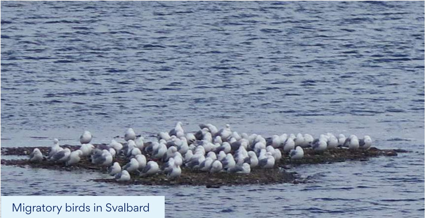
Migratory birds in Svalbard

3.0.9 Promote the use of high environmental standards by Indian enterprises while engaging in scientific and economic activities in the region.