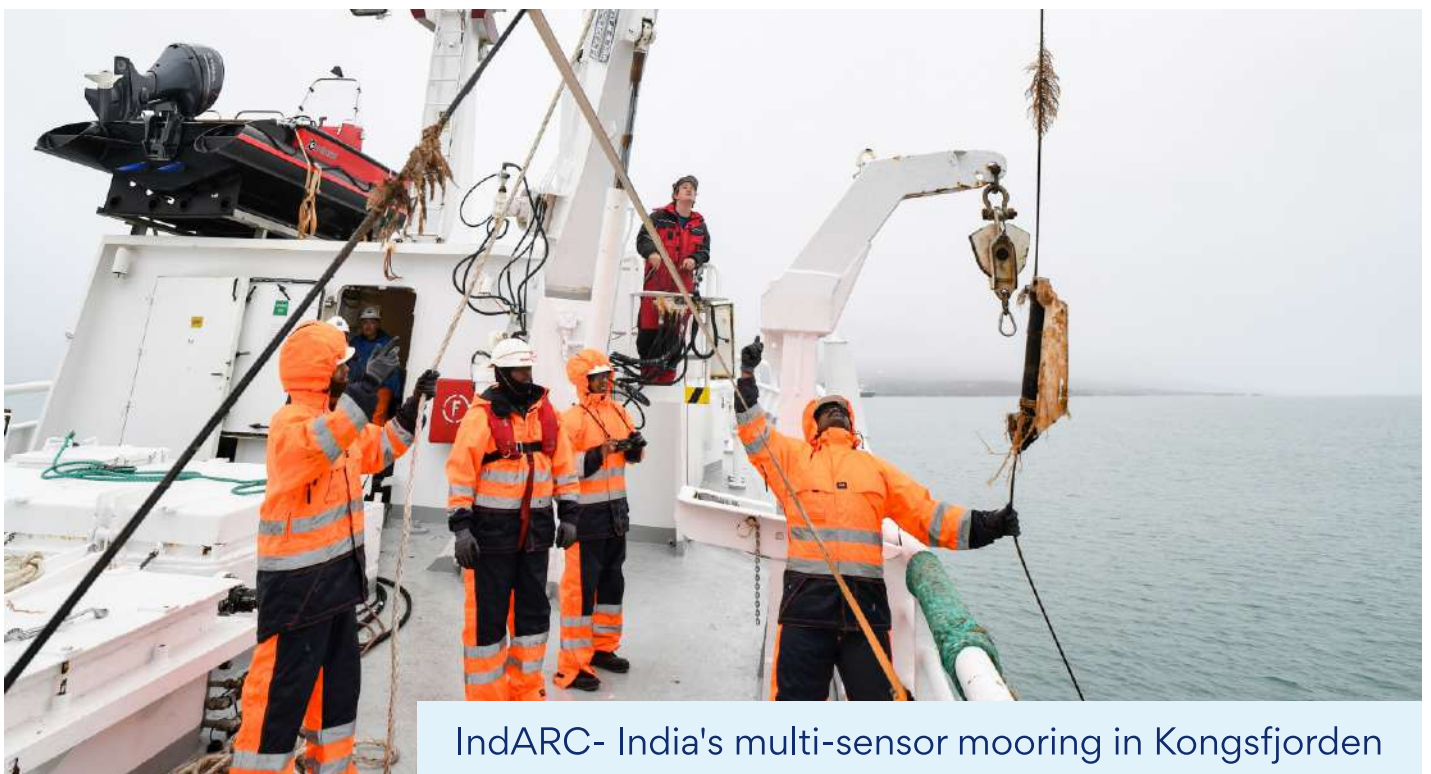
IndARC- India's multi-sensor mooring in Kongsfjorden

1.2.5 India's focus on cryospheric research, or the study of permafrost, snow and ice, has assisted in increasing the understanding of the Arctic. India has also been actively involved in studies related to the Arctic oceanography, atmosphere, pollution and microbiology. Over twenty-five Institutes and Universities are currently involved in Arctic research in India. About a hundred peer-reviewed papers have been published on Arctic issues since 2007.