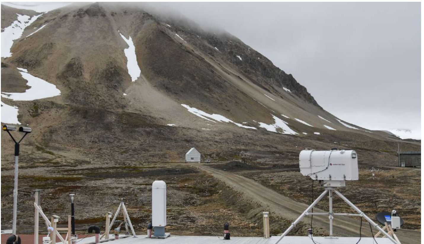
Atmospheric instruments installed at the Gruvabadet Atmospheric Laboratory, Ny-Ålesund, Svalbard operating round the year

2.1.13 Actively participate in the International Arctic Science Committee, Ny-Alesund Science Managers Committee, Svalbard Integrated Earth Observing System, the University of the Arctic, Arctic Circle Assembly, Arctic Frontiers, Arctic Science Summit Forum initiatives and encourage hosting of Arctic-related events in India.