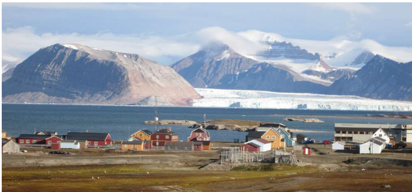
Ny-Ålesund – a research town in Svalbard, housing research stations of around 11 countries